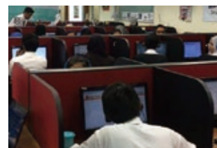
A call center