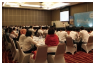
Sales agent channel meetings