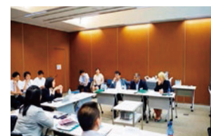
A forum with investee insurance companies

We invite specialists from overseas insurers in which Nippon Life has invested to forums to enable discussion of case studies with a view to generating synergies and boosting profitability. Separately, we hold seminars for managerial representatives of Asian life insurers to promote business development and forge personal networks. We also undertake numerous exchanges of personnel with our alliance partners, sending interns to work with partners and inviting various personnel from partners to work with us.