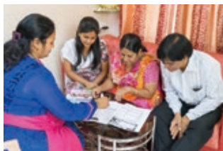
Visits to customers