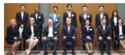
Senior management of each company