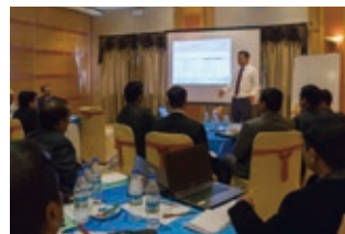
Sales representative channel meetings