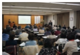
A Dementia Care Seminar

The Nippon Life Saiseikai Foundation and NLI Research Institute jointly hold seminars at Nissay Hospital to provide easy-to-understand information on prevention and treatment of dementia as well as care insurance and treatment programs for the disease.