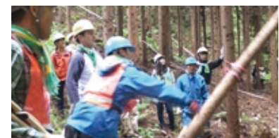
Activities to foster tree growth at “Nissay Natsudomari Forest” (Aomori Prefecture)

Over 23 years approx. 31,619 participants