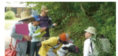
A Nissay "Forest Explorers" program outing (Hyogo Prefecture)

In fiscal 2014, 123 participants in Shizuoka, Shiga and Hyogo