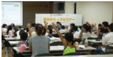
"Did you know about the secrets of insurance?" (Nissay Life Plaza Fukushima)

In fiscal 2014, 1,245 participants at 41 locations