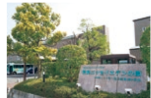
Nara Nissay Eden-no-Sono

Recognized by the Ministry of Health, Labour and Welfare for "Promoting health and longevity in 21st century hometowns"