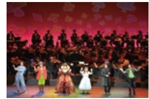
Nissay Masterpiece Series Alice's Classic Concert

In fiscal 2014, 4,927 children invited to shows