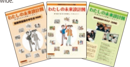
"My Plan for the Future" is an educational tool for schools

In 6 years, approx. 1,400,000 books provided to junior high schools