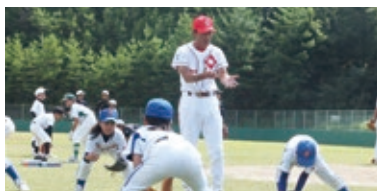
Baseball clinic (Tottori Branch)

Baseball clinics In fiscal 2014, 2,933 participants