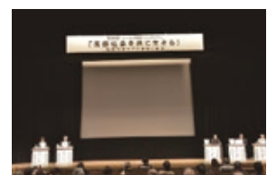
28th Symposium on Supporting an Aging Society

Over 32 years approx. ¥1.52 billion donated to 506 projects