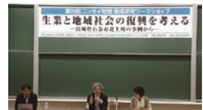
28th Environmental Issue Research Grant Workshop

Over 36 years approx. ¥2.65 billion donated to 1,091 projects