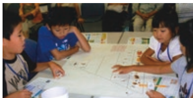
Nissay "Forest Seminars" (Nissay Life Plaza Shonan)

In fiscal 2014, 3,000 participants at 96 locations