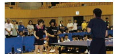
Table tennis clinic (Yamaguchi Branch)

Table tennis clinics In fiscal 2014, 1,781 participants