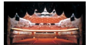
At the Nissay Theater (Tokyo)

Producing and staging performing arts Nurturing and supporting performing artists