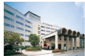
Nissay Hospital (Osaka)

Designation as an cancer diagnosis and treatment center for Osaka Prefecture Number of outpatients Approximately 220,000 per year