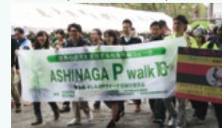
Orphan support activities (Central Tokyo General Branch)