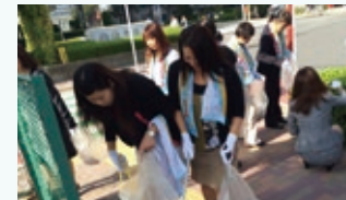
Community cleanup activities (Funabashi Branch)

Nippon Life employees are engaged in a wide variety of community-rooted volunteer activities, including community cleanups with local government organizations and activities in support of orphaned children. Since 2008, all our branches nationwide have been involved and a cumulative total of approximately 170,000 people have participated.