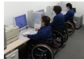
NISSAY NEW CREATION Office

Nippon Life established NISSAY NEW CREATION in 1993 and works to promote employment of people with disabilities as well as increased understanding of disabilities throughout the Group as a whole, through such activities as internal training in which NISSAY NEW CREATION employees serve as instructors.