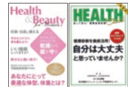
Health handbooks for men and women

The Nippon Life Saiseikai Foundation actively provides beneficial information on promoting health and preventing illness nationwide by overseeing the distribution of various health-related pamphlets by Nippon Life sales representatives to customers.