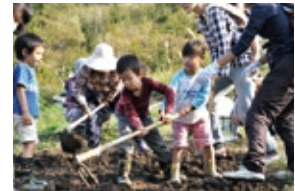
Cooperative childraising NPO Satonko (Aichi Prefecture)

Over 36 years, approx. ¥7.89 billion donated to approx. 12,000 groups