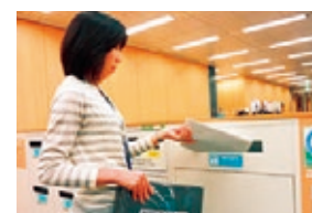
Recycling station (Marunouchi Building)

Our Osaka Head Office and Tokyo Headquarters received ISO 14001 certification