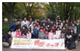
"Healthy Kids" experience-based nature class

In addition to "visiting lessons" and "in-house lessons" provided by Nippon Life, Group companies and foundations provide specialized occupational learning opportunities at facilities such as Nissay Hospital, Nissay Theater, and Nissay Eden-no-Sono in Nara and Matsudo.