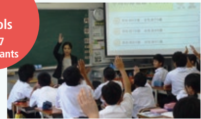
Visiting lessons (Shiga Prefecture)

In fiscal 2014, 71 schools 7,227 participants