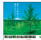
Poster for Nissay Planting and Nurturing Forests for Future Generations Campaign

Achieved campaign goal of planting one million trees in 2002 and Nissay Planting and Nurturing Forests for Future Generations Campaign began the following year.