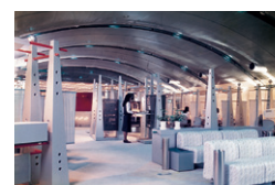
1st outlet Nissay Life Plaza Shinjuku

Nippon Life continues to develop a nationwide network of service counters for customers staffed by financial planners who provide specialized consulting services.