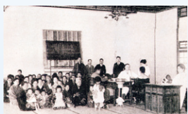
A traveling clinic in Shikoku (1930)

The foundation is deeply involved in social welfare work, including free medical checkups, and opened the Nissay Hospital attached to the Nippon Life Saiseikai Foundation in 1931.