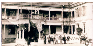
Commemorative event celebrating the attainment of ¥10 million in amount of policies in force (1895)

In 1895, attained the industry's number two position with amount of policies in force valued at ¥10 million, and achieved the top position in 1899, a mere 10 years after founding.