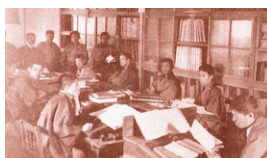
Actuarial department in charge of closing of books (1895)

Paid dividends to policyholders in Japan after the first closing of books, keeping its promise to customers.