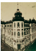
Former corporate headquarters (1902-1959)

New Company headquarters, built in stately red brick and granite, was designed by Kingo Tatsuno, who also designed Tokyo Station.