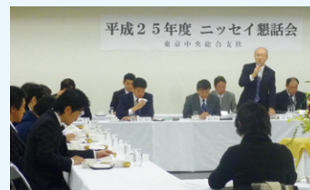
A Nissay Konwakai meeting

Specifically, the Company has built a system that more widely reflects policyholder feedback in management through a mutual company framework, and through holding Nissay Konwakai meetings at branches nationwide. In addition, to ensure that external points of view are actively incorporated and that a system of checks and balances is placed on management, we have appointed several outside directors and outside audit and supervisory board members. We have also established an Auditing Department to ensure that operations are sound and carried out properly.