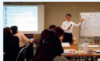
Female management education and training

To upgrade training for the next generation of employees, promote women succeeding in the workplace and inspire recruitment of people with disabilities to "create the future," we are striving to create workplaces with diverse human resources.