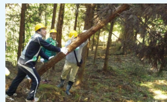
Nissay Otaki Forest (Chiba Prefecture)

In addition to initiatives aimed at reduced resource and energy use in business activities and providing information to customers, we are also engaged in forestry protection through planting forests for future generations.