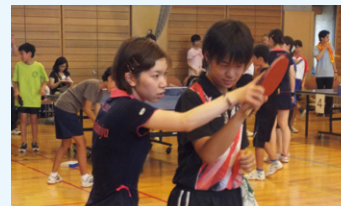
Table tennis clinic (Musashino branch)

Nippon Life employees are active in volunteer activities, including cleaning up local communities, conducting sports clinics and other programs, such as activities passing on to children the importance of insurance and protecting the environment.