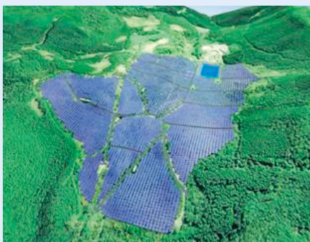
Artist's impression of Ashikita Mega-Solar Power Plant

Nippon Life intends to continue providing more loans for renewable energy projects, with the view to generating long-term, stable returns.