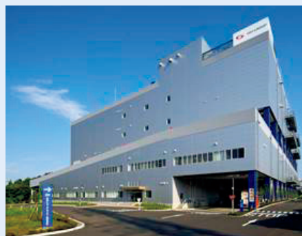
Exterior view of Atsugi Logistics Center

Nippon Life has executed investments in prime real estate centered on office buildings to generate long-term, stable investment returns from the standpoint of safeguarding policyholder interests. Looking ahead, we intend to step up investment in forecast high-growth areas such as large-scale logistics facilities, which are a vital core infrastructure supporting people's daily lives.