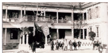
Commemorative event celebrating the attainment of ¥10 million in amount of policies in force (1895)

In 1895, attained the industry's number two position with amount of policies in force valued at ¥10 million, and achieved the top position in 1899, a mere 10 years after founding.