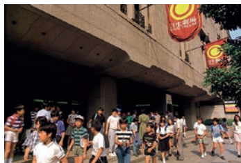
Elementary school students invited to the theatre