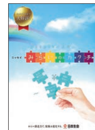
Mirai no Katachi

Revolutionized insurance products under the concepts of "perfect for every individual customer."