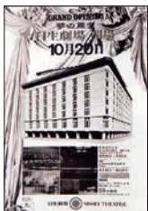
Nissay Theater opening poster

Nissay Theater opened in the newly constructed Hibiya Building with the aim of contributing to Japanese arts and culture.