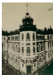
Former corporate headquarters (1902-1959)

New Company headquarters, built in stately red brick and granite, was designed by Kingo Tatsuno, who also designed Tokyo Station.