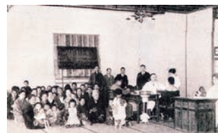
A traveling clinic in Shikoku (1930)

The foundation is deeply involved in social welfare work, including free medical checkups, and opened the Nissay Hospital attached to the Nippon Life Saiseikai Foundation in 1931.