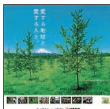
Poster for Nissay Planting and Nurturing Forests for Future Generations Campaign

Achieved 1992 campaign goal of planting one million trees in 2002 and Nissay Planting and Nurturing Forests for Future Generations Campaign began the following year.