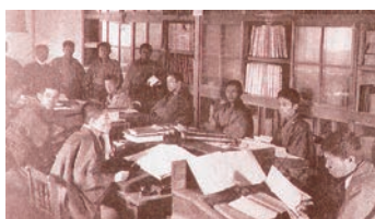
Actuarial department in charge of closing of books (1895)

Paid dividends to policyholders in Japan after the first closing of books, keeping its promise to customers.