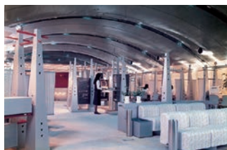
1st outlet Nissay Life Plaza Shinjuku

Nippon Life continues to develop a nationwide network of service counters for customers staffed by financial planners who provide specialized consulting services.